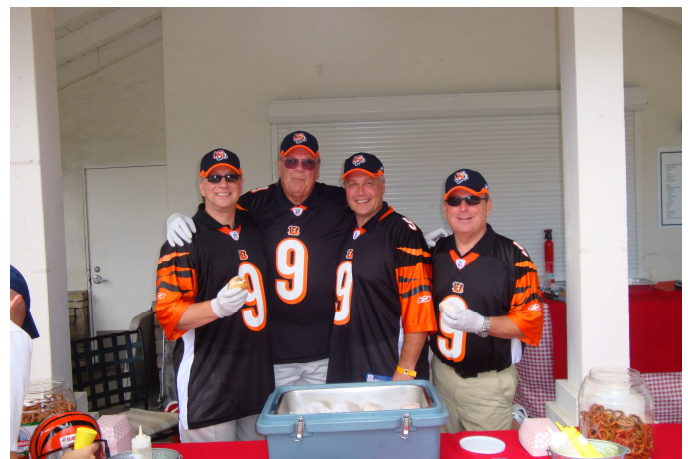
Hillview friends and Carson Palmer fans, the Full Moon Food-ski guys cooked up delicious sliders for golfers.