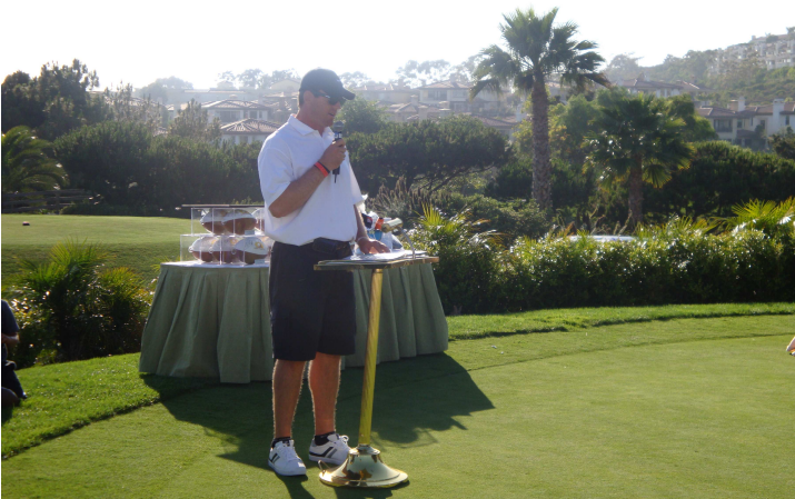
Carson Palmer thanking the participants of the 6th Annual Carson Palmer Open 2009 held at Monarch Beach Golf Links.