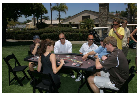
Sweet Deal challenged players to blackjack in between holes.