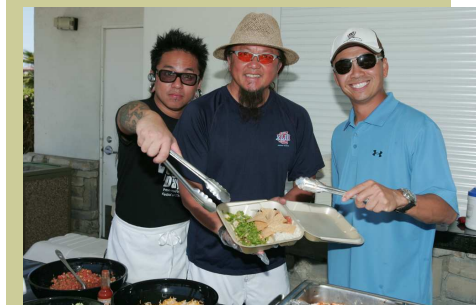
Wahoo's served up some great tacos out on the course