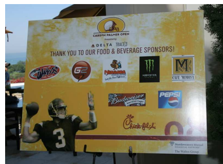
Many food & beverage sponsors!