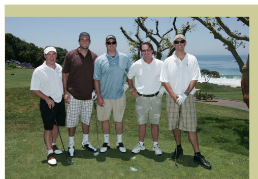
Matt Leinart (second to left) with his foursome