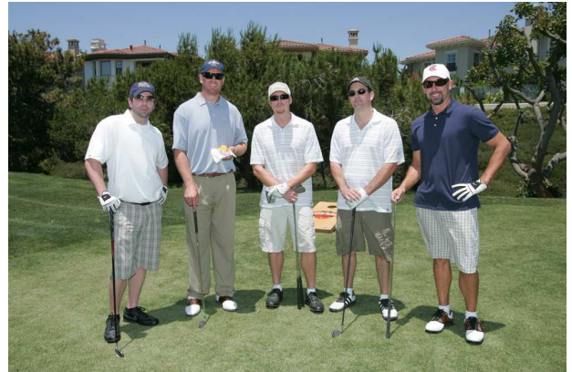
Carson Palmer teamed up with his foursome out on the Monarch Beach Golf Links.

When the players arrived at each hole they were greeted with the opportunity to participate in a unique challenge or activity